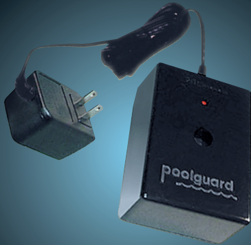
In House Remote Receiver